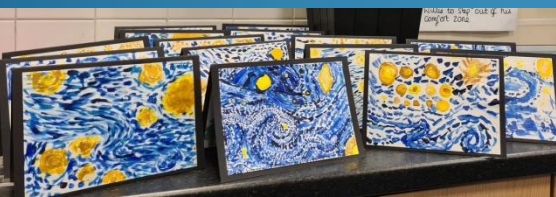
Year 5's stunning Epiphany themed Christmas cards